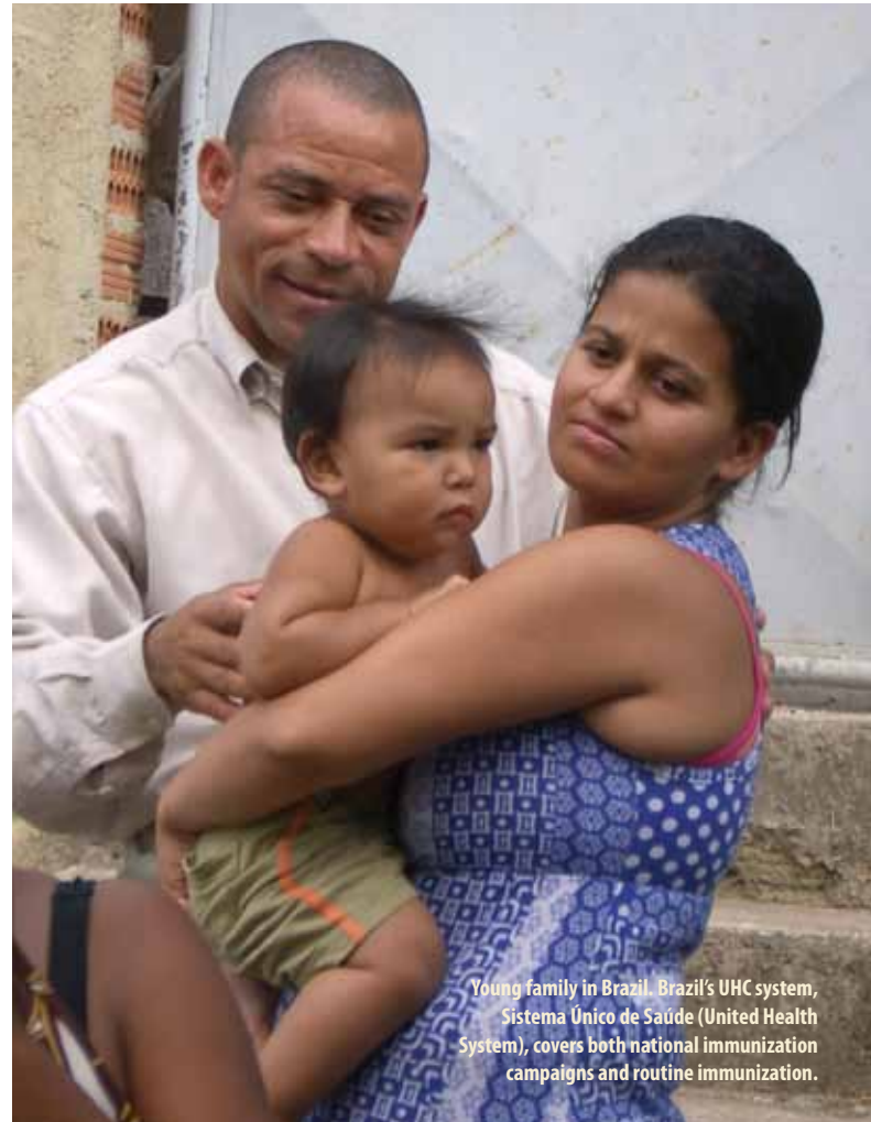
Young family in Brazil. Brazil’s UHC system, Sistema Único de Saúde (United Health System), covers both national immunization campaigns and routine immunization.

Participants generally concurred that the price of individual vaccines matters and will be a key factor in determining whether countries decide to include them in health and UHC budgets in the future. Making the case to continue